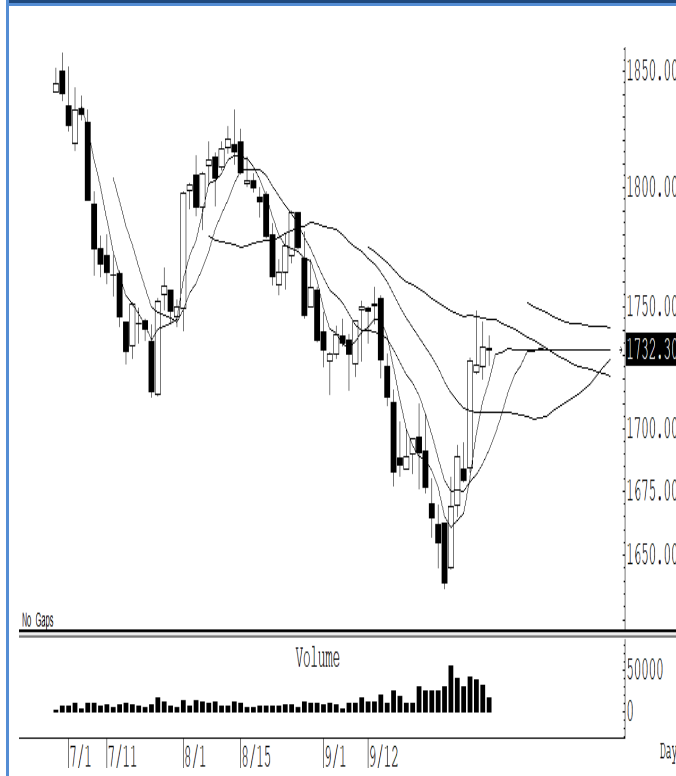
GOZ22 (Close 1,732.30 Chg -0.90)

ราคาทองคำโลกแกว่งออกด้านข้าง ยังคงติดแนวต้านสำคัญแถว ๆ 1,745 ดอลลาร์ สั้น ๆ ไม่ข้ามแถว ๆ 1,745 ดอลลาร์ คาดว่าน่าจะย่อตัวลง แนะนำ trading ในกรอบระหว่าง 1,745-1,705 ดอลลาร์ รับรู้กำไร ในกรณีที่บีบต่ำกว่าระดับ 1,675 ดอลลาร์ แนะนำ ถือ short หวังผลปรับตั้ลงไปแถว ๆ 1,620 ดอลลาร์ รับรู้กำไร